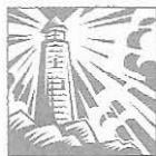
Presence of the Holy Spirit