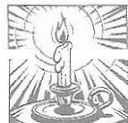
Presence of the Holy Spirit

13 Others mocking said, "They are full of new wine."